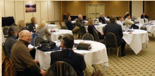
2011 Orientation Attendees